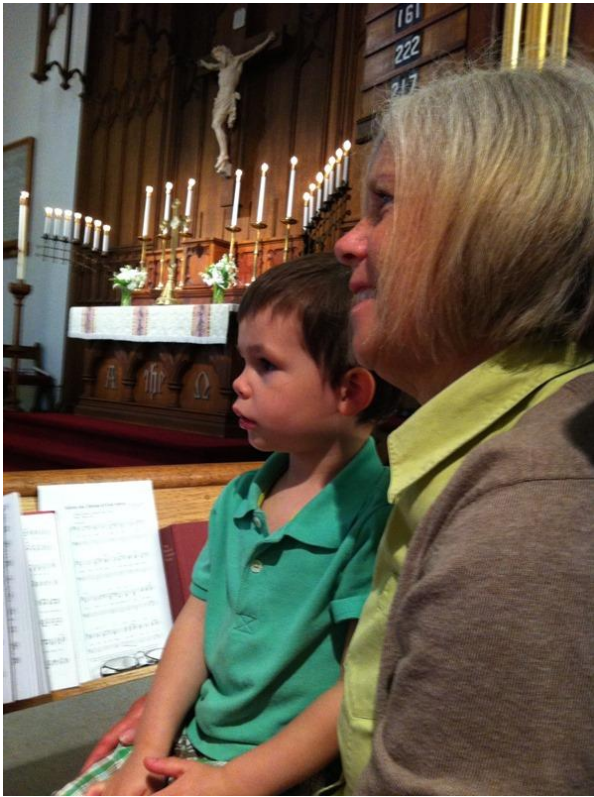
OUR NEWEST CHOIR MEMBER