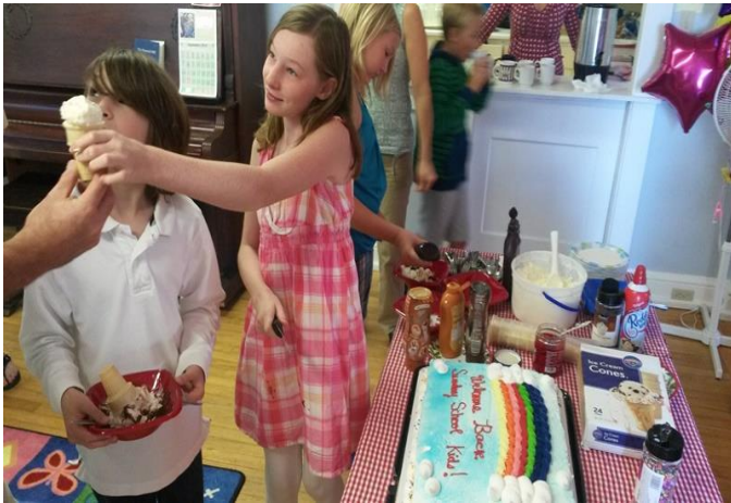
CELEBRATING THE BEGINNING OF SUNDAY SCHOOL