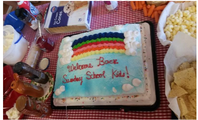
THE CAKE WAS REALLY GOOD!