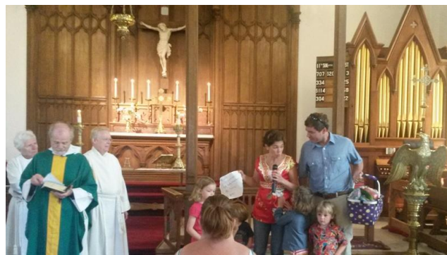
Presenting the veggies