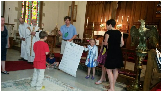
SUNDAY SCHOOL REPORT