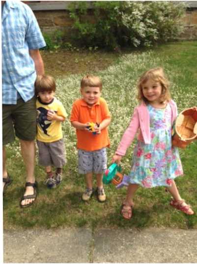
SUNDAY SCHOOL .