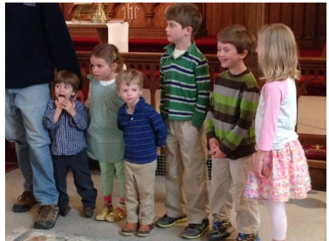
SUNDAY SCHOOL REPORT